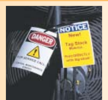
Print Directly to Tag Stock